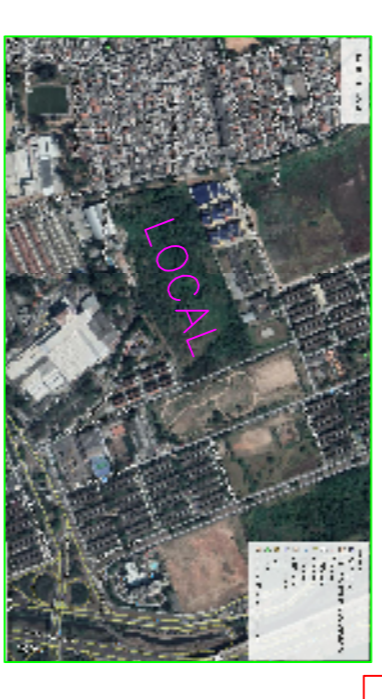
LOCALIZACAO S/ ESCOLA

REFERENCIA PLANIMETRICA, COORDENADAS TOPOGRAFICAS, GEODASIA POS-PROCESSAMENTO DE DADOS CORS - 96E-FRP - MZ2 COORDENADAS REFUTAVE-SM-V15 (S-55) 08/01/03 LOCALIZACAO NO AEROFOTO DA RUA GERALDO ALVES CELESTINO, EM PRIMEIRO PLANO, EM CORTEZINHO - PREREBELIA, MUNICIPIO DE GUARULHOS, ESTADO DE SP - COORDEADAS: 23° 52' 53,10" S - 46° 42' 09,00" W